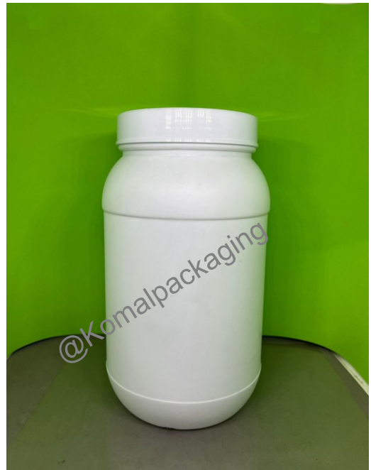
1kg groove Jar