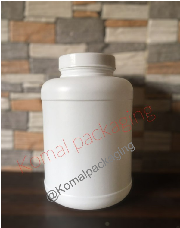
2/3kg Regular Jar