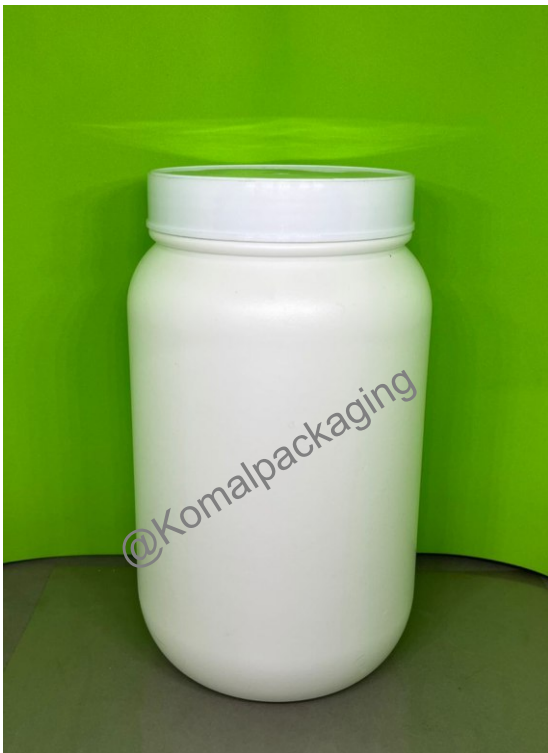
1kg Plane Jar