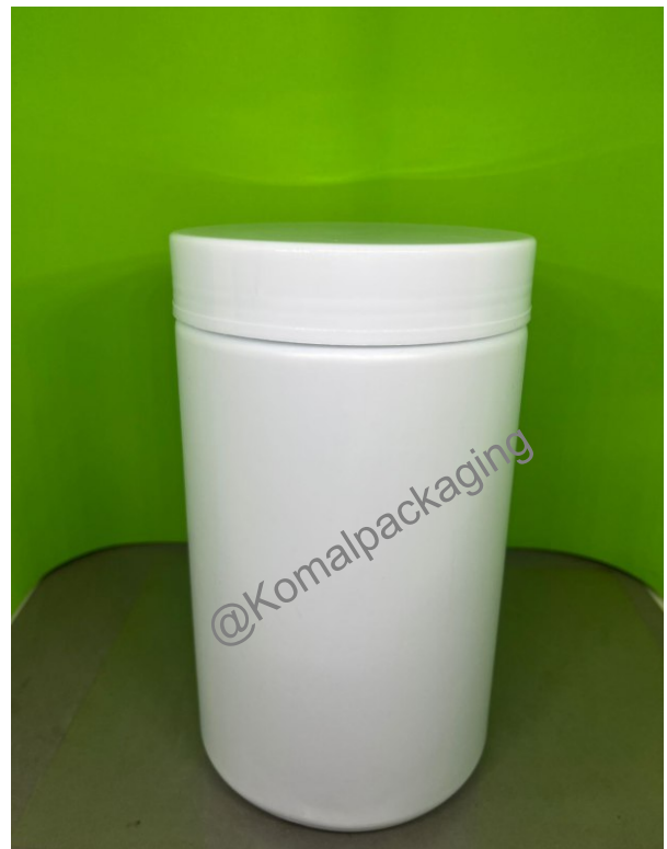
130mm Cap Jar