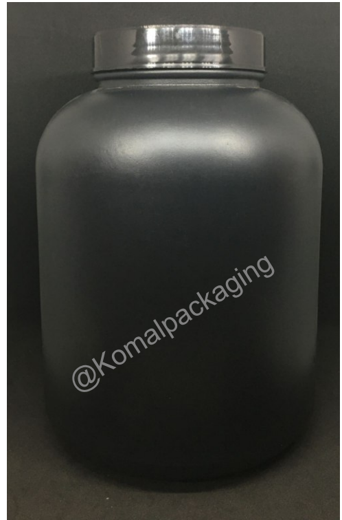
2/3kg Govardhan Jar