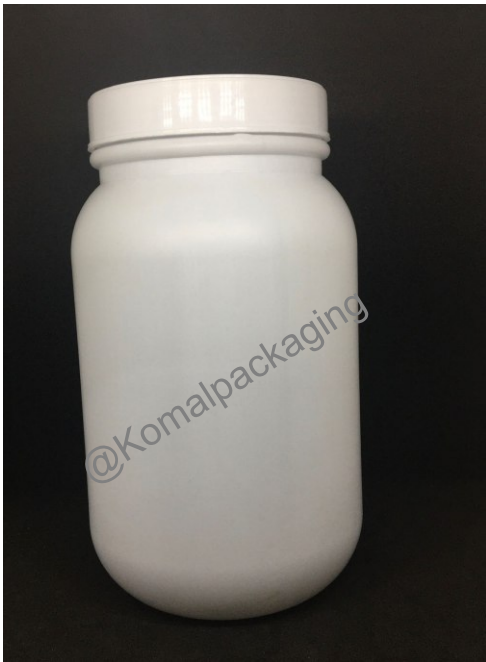
1kg Tray Jar