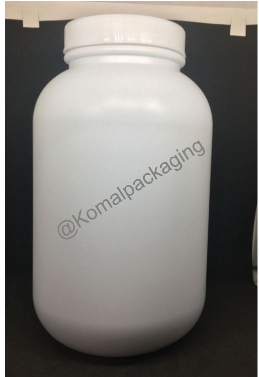
3kg Tray Jar